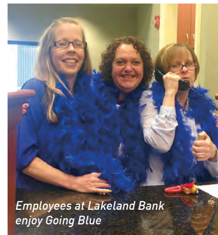
Employees at Lakeland Bank enjoy Going Blue

To raise awareness for children who are victims of abuse and neglect during April's National Child Abuse Awareness and Prevention Month, New Jersey's Governor Chris Christie designated Friday, April 4th, as "CASA Child Advocate Day." CASA of Morris and Sussex Counties recognized this day by engaging the community to "Go Blue" by wearing denim to school or work. Each participant donated $5 to CASA. The goal of this event was not only to raise funds, but also to heighten awareness of the plight of the most vulnerable children in the community. Law firms, businesses and schools participated to raise over $15,000.