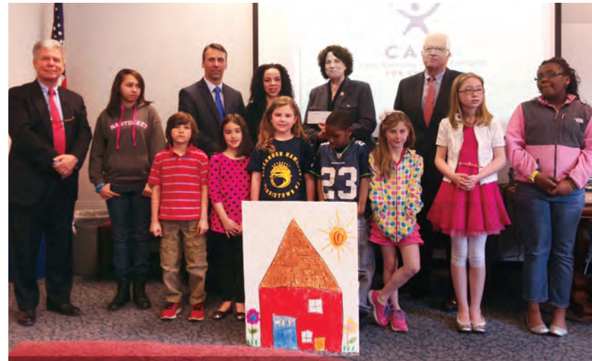
Students and Faculty representing the Morris School District

The Morris School District is to be commended for its commitment to teaching children the importance of voting and giving back to the community in such a tangible and meaningful way.