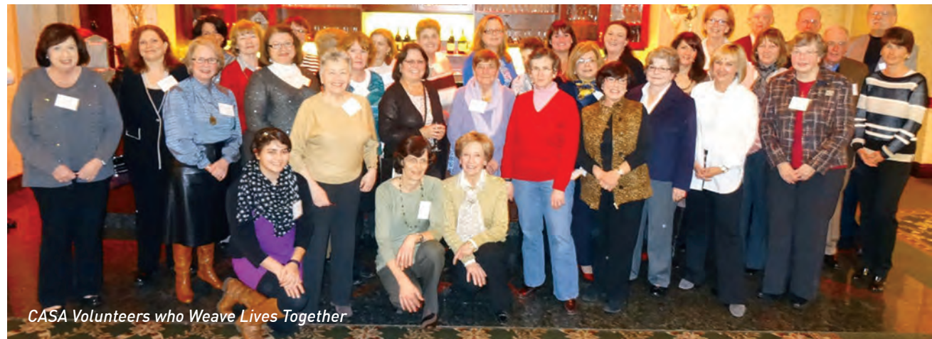
CASA Volunteers who Weave Lives Together