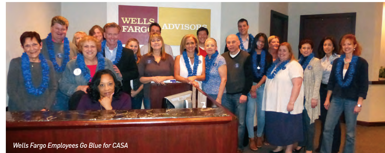
Wells Fargo Employees Go Blue for CASA